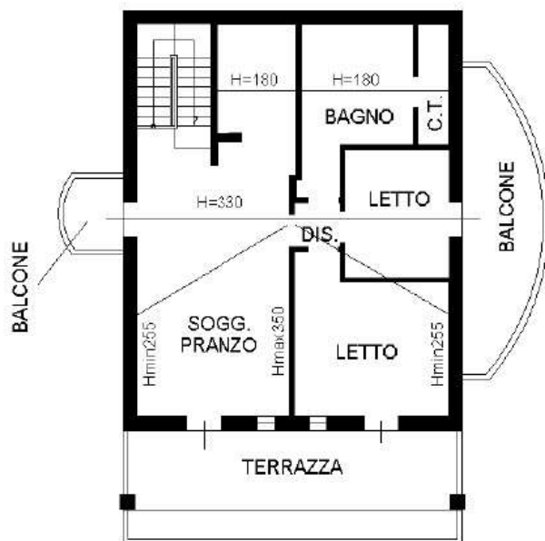
PIANO SECONDO (Sottotetto)