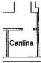
Piano Primo sottostrada H = 2.50