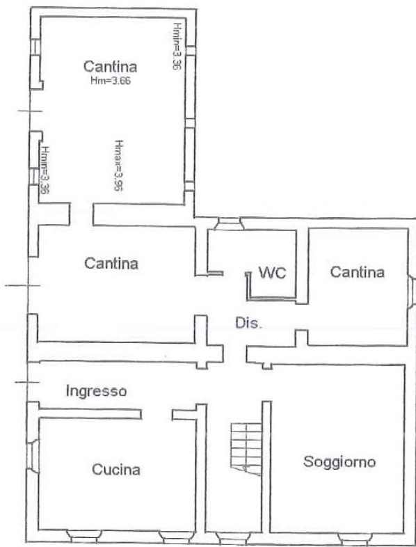
PIANTA PIANO TERRA H=2.75